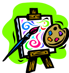
Painting, sculpture, drama, drawing and photography were the mediums offered.

The Youth Arts Initiative, made possible by a grant from the Metlife Foundation, has dramatically influenced the lives of 50 youth in Central New York. The youth, aged 10 - 14, came together each month throughout the last school year and had the opportunity to learn from artists. Each youth chose a